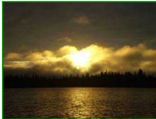
Sunrise on Fish Lake