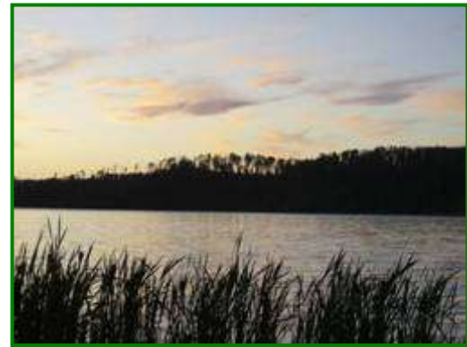
September Klotz Sunset