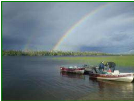
Rainbow Over Klotz-Aug.